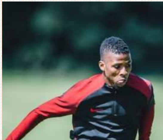
Kelechi Iheanacho, Nigeria

Do you think that having self-confidence is having a realistic perspective on what you can achieve?