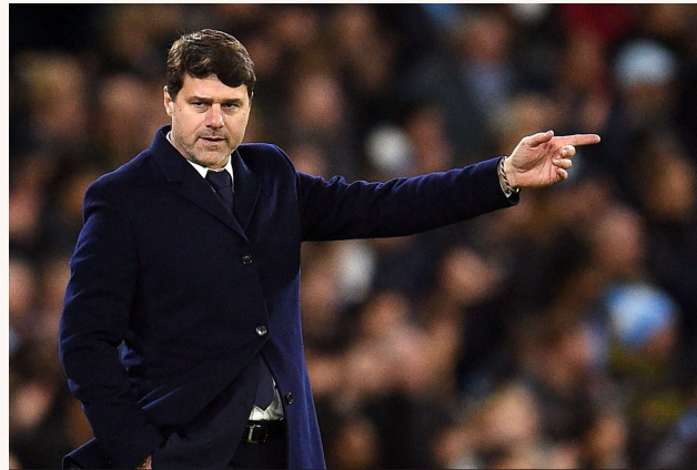
M. Pochettino, Argentine Winner French Cup 2020-21 with PSG