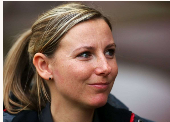
Vicky Jepson, England

Why is it important to act calmly under pressure?